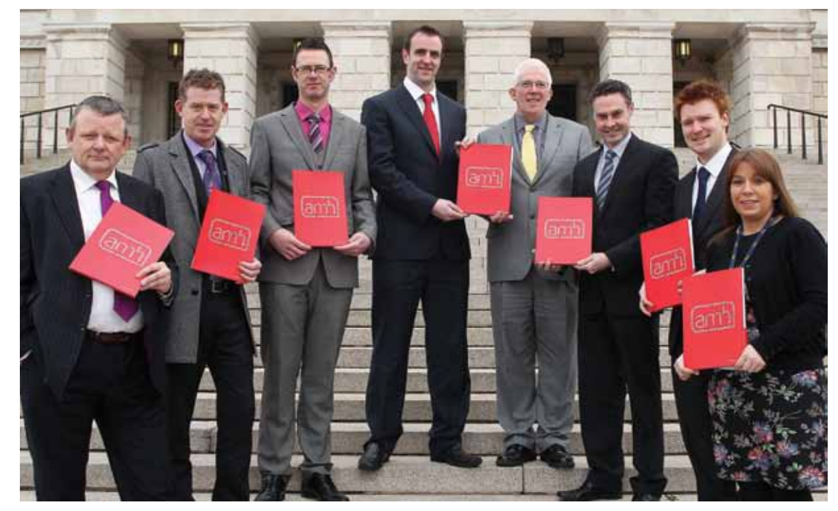
As the Northern Ireland Assembly Commission's charity of the year, AMH offered a bespoke training course for MLA constituency staff across Northern Ireland. This bespoke course delivered by AMH Works was developed with input from MLA staff.