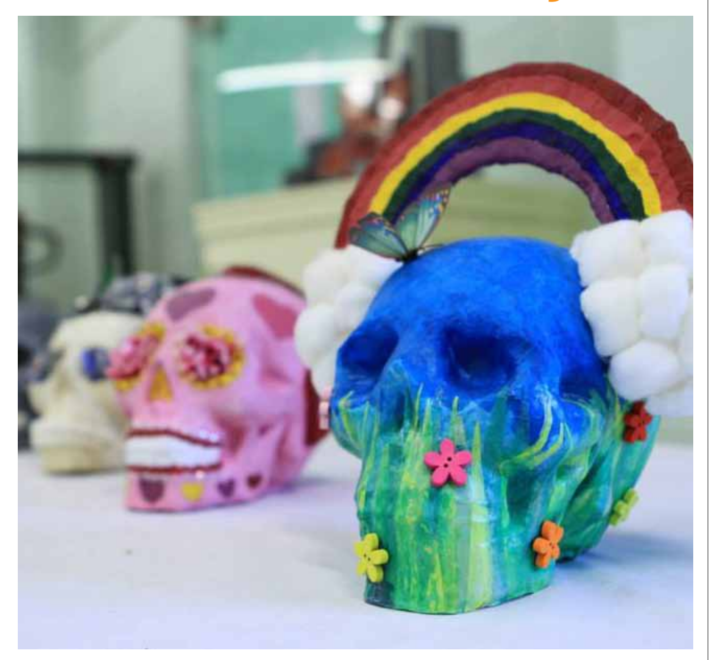
A very talented client in our AMH New Horizons Foyle service, created these fantastic art pieces as part of the CCEA Creative Crafts Level 3 Project. The final pieces comprise 5 skulls reflecting different feelings and thought processes from being unwell, feeling caged or paranoid through to happiness and love. We never cease to be impressed by the creativity and skills shown by our clients!