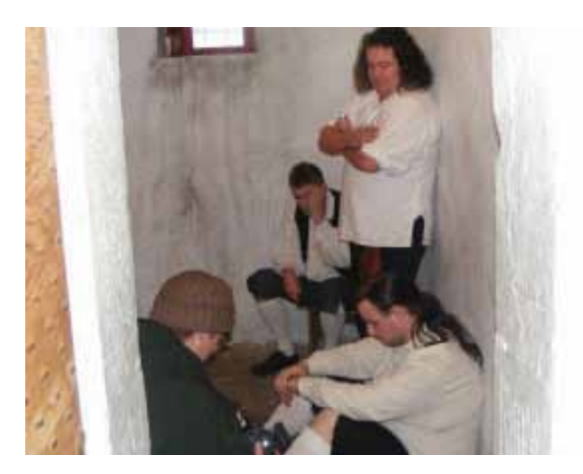
Clients at AMH New Horizons in Downpatrick worked with Blue Bird Media Company and the Down County Museum to create a film exploring crime and punishment in the old Downpatrick Gaol in the 1800s. Clients gathered information on gaol conditions and prisoner stories as well as crimes and punishments of the times by researching prisoner detail sheets and newspaper articles. The film, entitled "Prisoners of the Past" was launched at the Eclipse Cinema, Downpatrick.