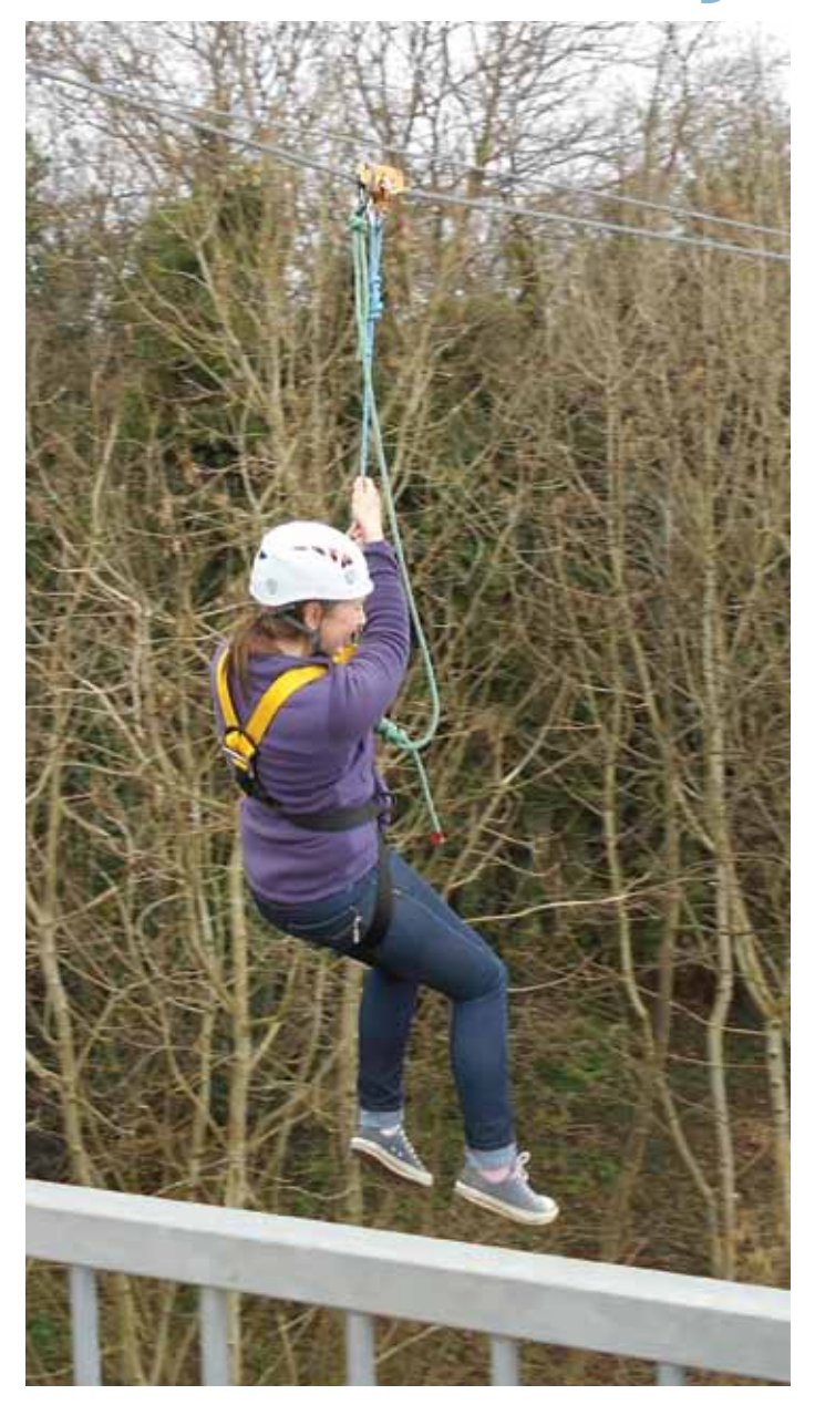
Clients from AMH New Horizons Derriaghy who are taking part in Positive Steps, challenged themselves by taking to the high ropes and zip lines at SKYTrek in Colin Glen Forest Park.