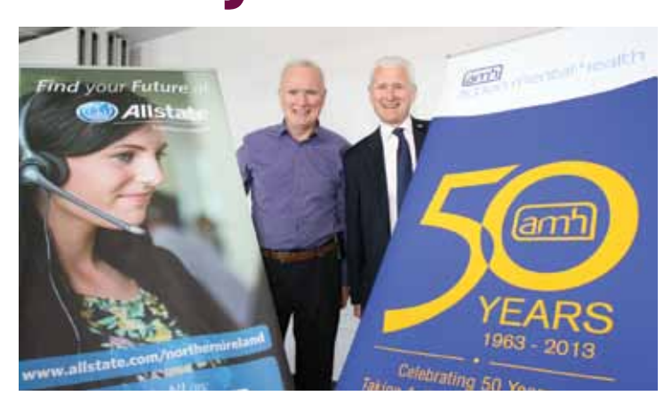
AMH were chosen by Allstate Northern Ireland as their Charity of the Year.

At the launch, AMH Works provided some Mental Health Awareness training including some advice on "Stress Busting" techniques. Allstate staff were treated to some head and shoulder massage – provided by Zenbu Therapies – which can be one way of relieving the stresses of daily life! All State NI raised a total of £6270 for AMH – Thank You!