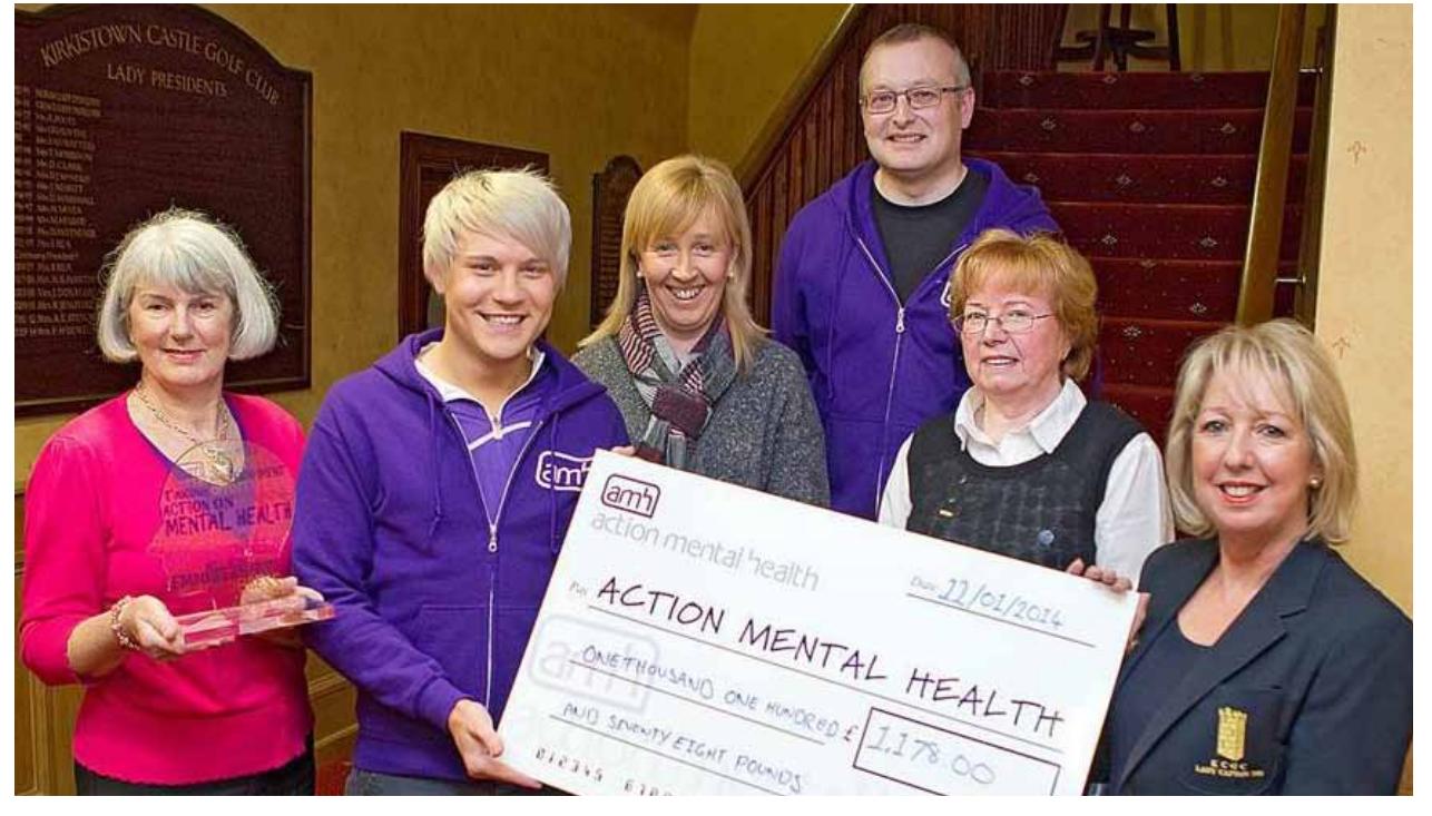
Thank you to Kirkistown Castle Golf Club for their donation of £1,178.00-to mark their donation the Golf Club received a "Head's Up" Award.