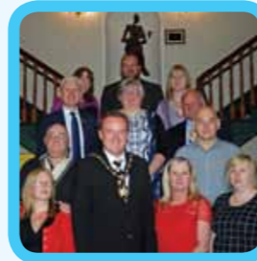
Success in Portadown