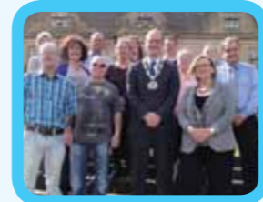
Tea with the Mayor in North Down & Ards