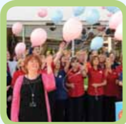
World Suicide Awareness Day