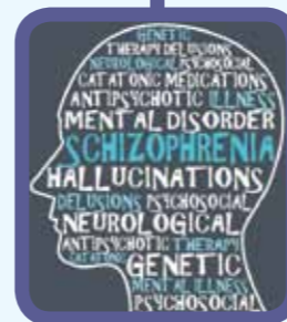
Let's Talk About Schizophrenia