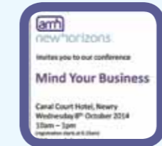
Minding your Business in Newry