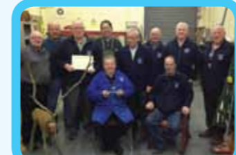
Men's Shed Champions