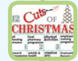
12 Cuts of Christmas