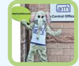
Elephant in the Room