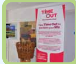
Time Out Exhibition