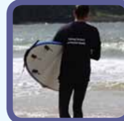
Antrim is Happy