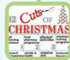
12 Cuts of Christmas