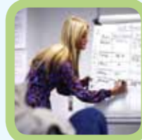
Personal Wellbeing behind bars