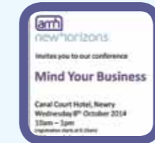
Minding your Business in Newry