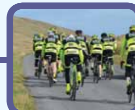
The Granite Challenge