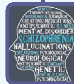
Let's Talk About Schizophrenia