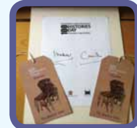
Royal Visit to Basket Case in Fermanagh