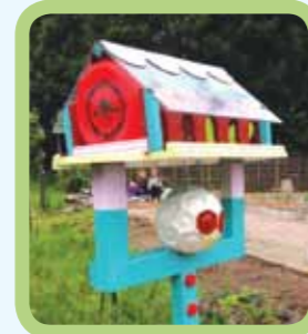
Muddy Minds launched in Antrim