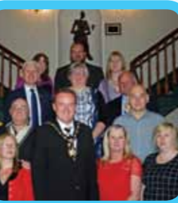
Success in Portadown