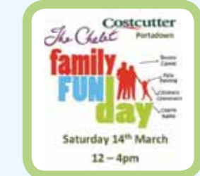
Fun Day at The Chalet