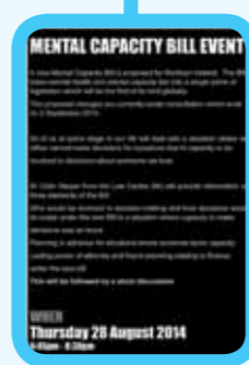
Mental Capacity Bill