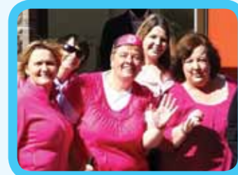
Giro Italia Fever & The Big Italian Bike Ride