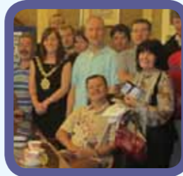
Promote - Guests of Belfast Lord Mayor