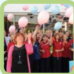
World Suicide Awareness Day