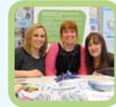
Happy Birthday MensSana