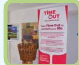
Time Out Exhibition