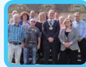
Tea with the Mayor in North Down & Ards