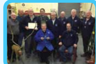
Men's Shed Champions