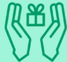
Staff only Donate instead of gifts